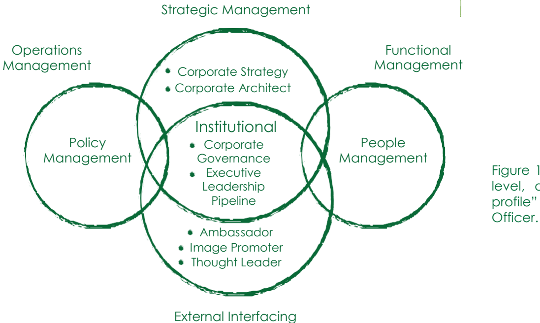
Figure 1: The Executive Officer Role Profile

"When you're the janitor, reasons matter.